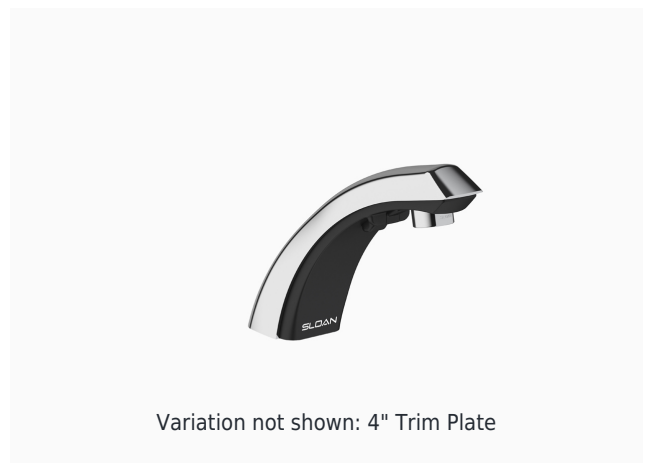
Variation not shown: 4" Trim Plate