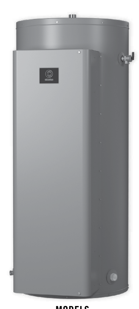
MODELS CSB-52, 82, 120

For complete warranty information, consult written warranty or statewaterheaters.com