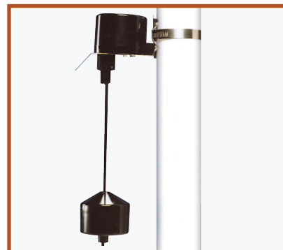
5050V Vertical Style Float