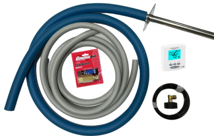
(Included) Duct Mount Kit

Duct Steam: install using included duct mount kit & metal mounting straps