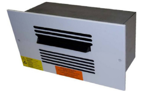
(Optional) Room Fan Kit GFI #7665 (115V) GFI #7660 (230V)