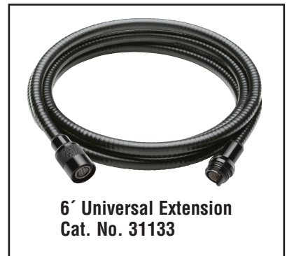
6' Universal Extension Cat. No. 31133