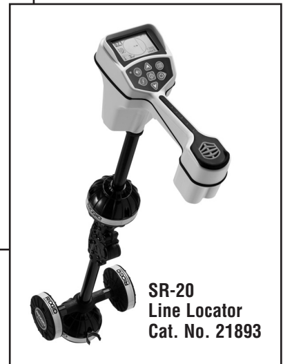
SR-20 Line Locator Cat. No. 21893