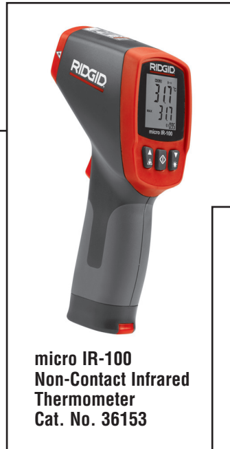
micro IR-100 Non-Contact Infrared Thermometer Cat. No. 36153