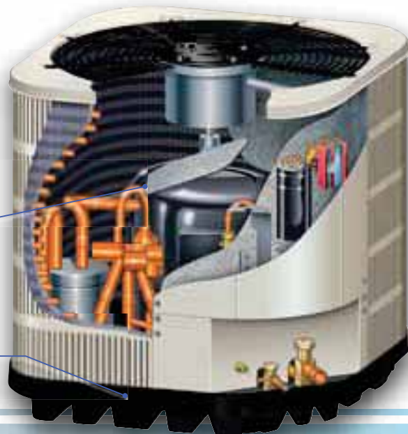
Model ET4BE 14 SEER, up to 8.5 HSPF Heat Pump