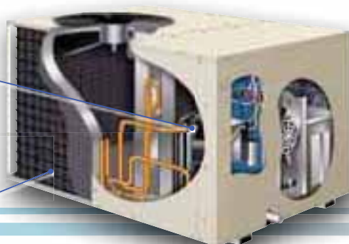
Model Q5RF 15 SEER, 8.0 HSPF Heat Pump

Wire coil guard and plastic mesh hail guard for coil protection