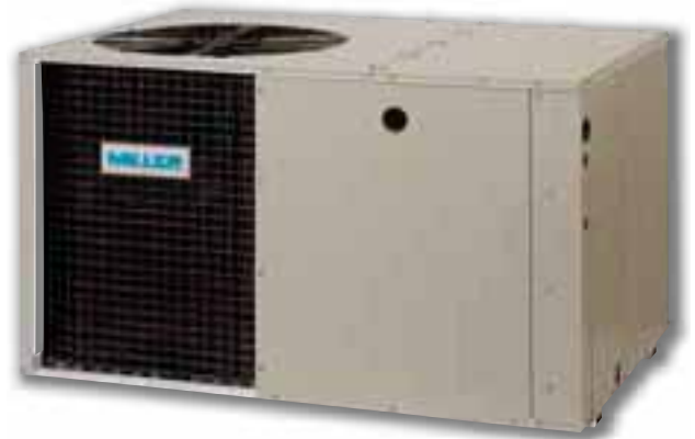
Models P7RE (14 SEER), Q7RE (14 SEER, 8.0 HSPF), P5RF (15 SEER) & Q5RF (15 SEER, 8.0 HSPF)