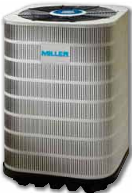
Models ES4BE, ES4QE, ET4BE & ET4QE

Miller high-efficiency split system air conditioners and heat pumps fit the bill for your cooling needs.