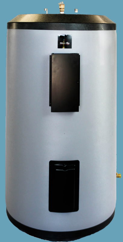
MODELS EC-66 | EC-80 | EC-119