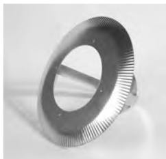
#54 Spring Collar