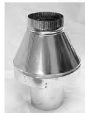
#56 Vertical Draft Diverter