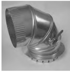
#90FGL Elbow Takeoff for Fiberglass w/ Damper - Tabbed