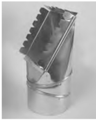
#15FG Adjustable Takeoff for Fiberglass