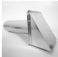
#13 Dryer Vent (w/ damper)