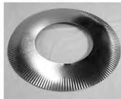
#51 Flat Collar