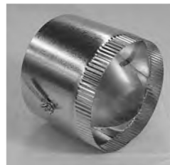
#61 Damper Section