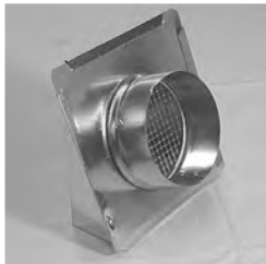
#12 Fresh Air Vent (w/ screen)