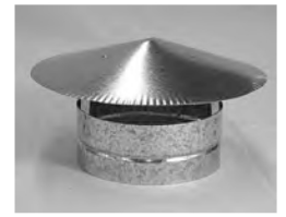
#53 Chimney Cap