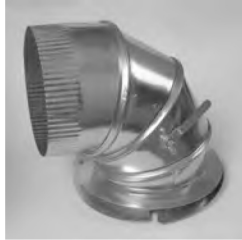
#91FG Elbow Takeoff for Fiberglass w/ Damper - Spin-in