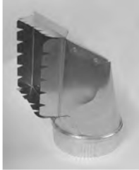
#16FG Non-Adjustable Takeoff for Fiberglass