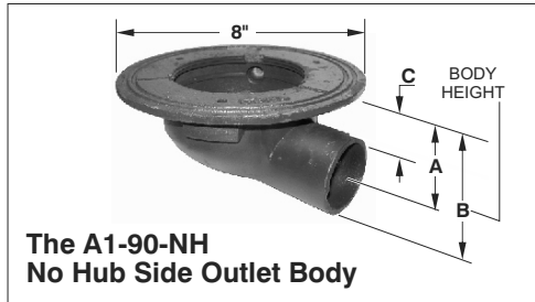
The A1-90-NH No Hub Side Outlet Body