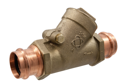
PC-413-Y-LF Press Ends