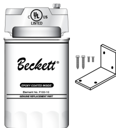
F100-2 F100-2B Complete Filter with bracket kit