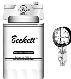
F100-4 Complete Filter with bleeder fitting and FLi ™ gauge