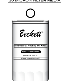
F100-11 Replacement Element, individually boxed with "O" ring

Need help identifying what you need? See cross reference on next page.