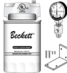
F100-6 Complete Filter with bracket kit, bleeder fitting and FLi ™ gauge