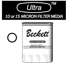
F99-10 F99-10B Replacement Element, indiv. boxed with "O" ring