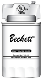
F100 Complete Filter