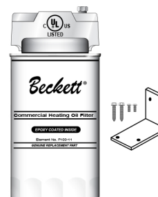
F100-3 Complete Filter with bracket kit