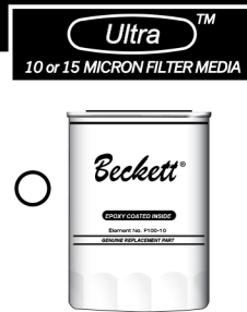
F100-10 F100-10B Replacement Element, individually boxed with "O" ring