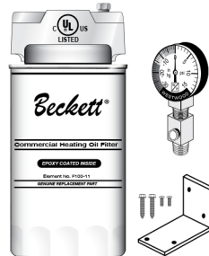
F100-7 Complete Filter with bracket kit, bleeder fitting and FLi ™ gauge