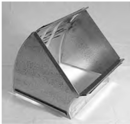
#145 Vertical 45° Elbow