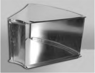
#125 Flat 45° Elbow