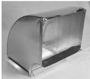
#140 Vertical 90° Elbow