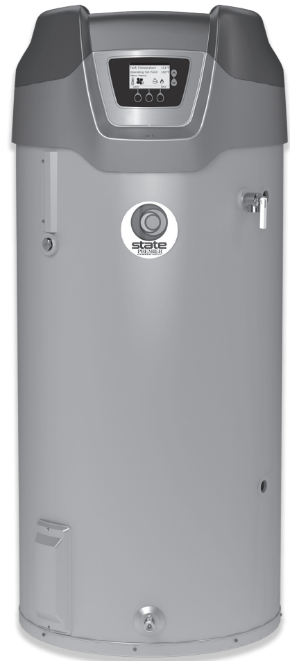
MODEL SHOWN GP6 75 SERIES 140/141

*Model GP6 50 4.31 GPM continuous flow, based on 65°F inlet water temperature, 110°F outlet temperature.