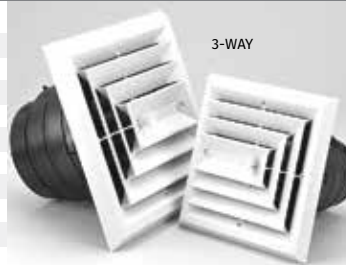
Throw measurements are equal in all three directions +/-5%