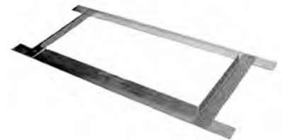
#330 Cold Air Return Frame