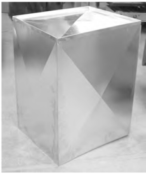
#100 Plenum Chamber

Duc-Pac has custom fit plenums for many equipment lines. Contact distributor for details.