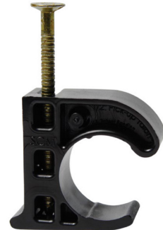
556-2 Patent # 7,207,530