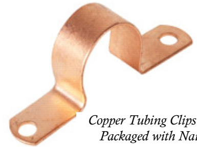
Copper Tubing Clips Are Packaged with Nails

Our Copper Plated Tubing Clips are designed to snap onto the tubing for hands free nailing.