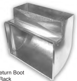
#151 Cold Air Return Boot with Filter Rack

20x14 opening fits new low profile furnaces