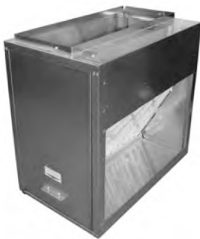
#156 90 Deg 5" Filter Box