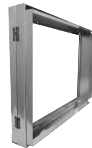
#154 1" Filter Rack