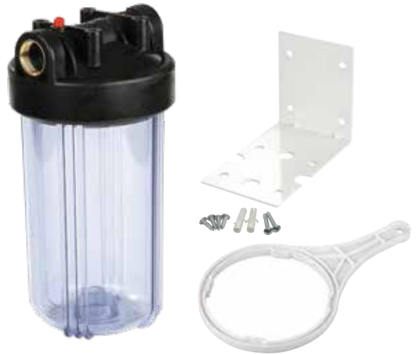
FDA CFR-21 compliant materials