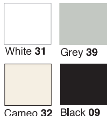
Cameo 32 Black 09