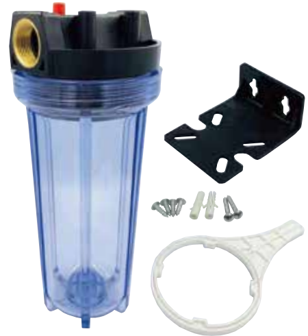
FDA CFR-21 compliant materials