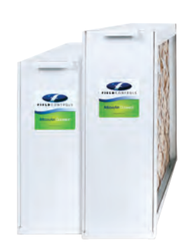
CLEAN Media Air Cleaner