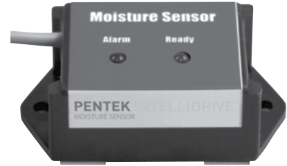
VFD-WS VFD WATER SENSOR WITH 15' CABLE

Pentek Transducer for use with Pentek Intellidrive and Intellidrive XL.