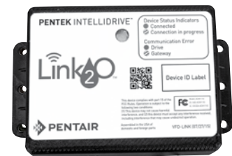
VFD-LINK WIRELESS TRANSLATOR FOR INTELLIDRIVE