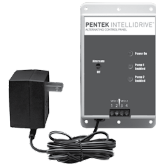
VFD-ALT VFD ALTERNATING PANEL