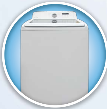
HE TOP LOAD