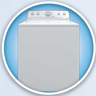
TRADITIONAL TOP LOAD