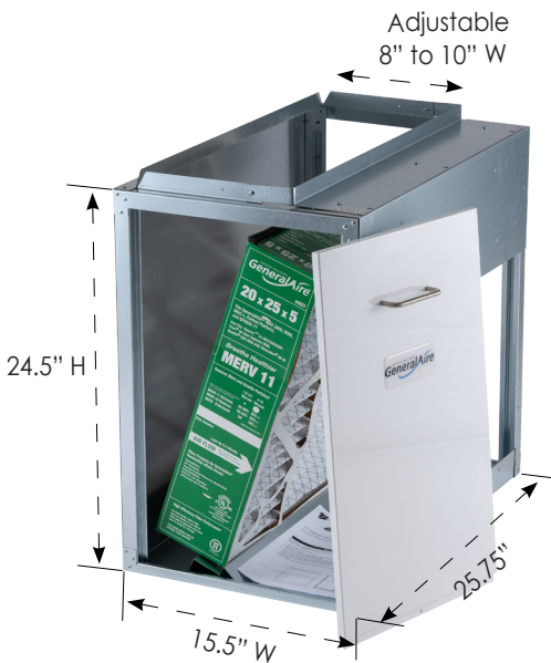
MAC-L **MERV 11 Standard