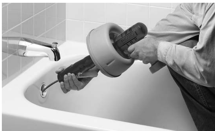
Cleans Drains Faster and Better: K-39AF advances and retrieves cable without changing motor direction.