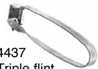
4437 Triple flint