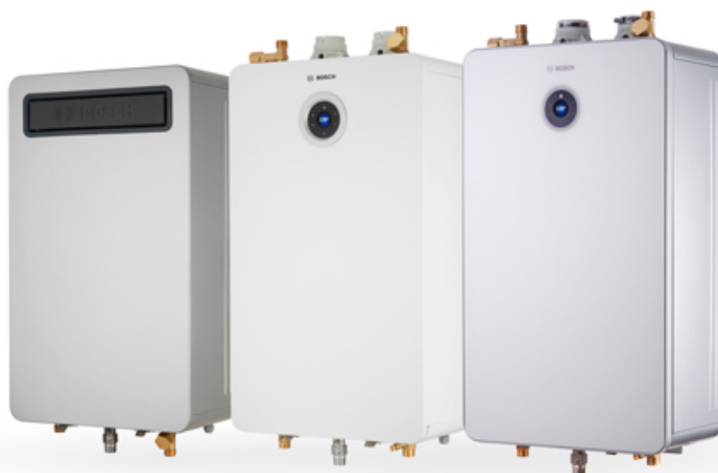
T9800 SE Outdoor