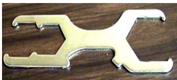
4-IN-1 LOCKNUT WRENCH