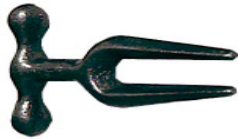
P.O. PLUG WRENCH