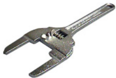
ADJUSTABLE LOCKNUT WRENCH