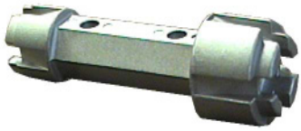
CROWN TUB DRAIN WRENCH