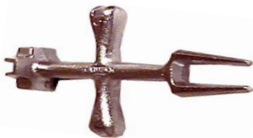
4-1 P.O. PLUG WRENCH