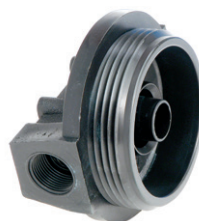
Buttress thread design — Provides greater security