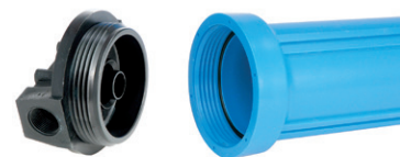
Heavy-duty construction — Housings are made entirely of the highest quality grade polypropylene