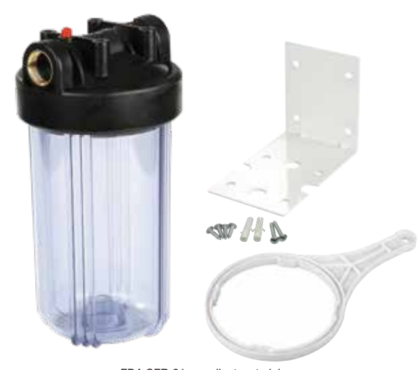
FDA CFR-21 compliant materials

LF brass threaded port Built-in manual bleed valve button Double O-Ring gasket Accepts most 10" big filter cartridges Fast cartridge replacement