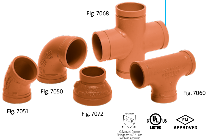
Fig. 7060 Tee Fig. 7076 Concentric Reducer (GR x THD)