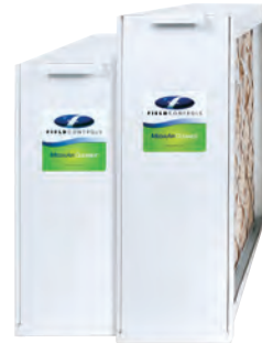
CLEAN Media Air Cleaner™