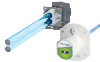
PURE UV-Aire® Purification