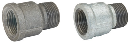
Extension Pieces 150# Malleable Iron Threaded Fittings FIP x MIP