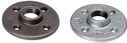
Floor Flange 150# Malleable Iron Threaded Fittings FIP