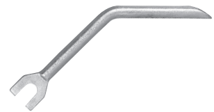
307-625 Patent # 6,460,432