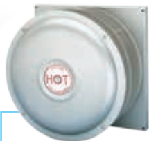
Vent Cap Assembly