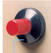
Manual Spark Igniter