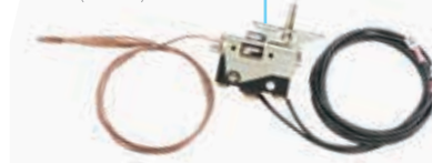
Optional Built-In Bulb Stat Kit (BBSK)

This heater may be installed in an aftermarket permanently located, manufactured home, where not prohibited by local codes.