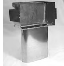
#620-OV Standard Oval Stackhead