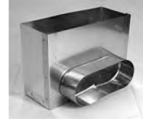
#630-OV Oval Box 90°