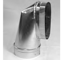
#612-OV Round to Oval End Boot