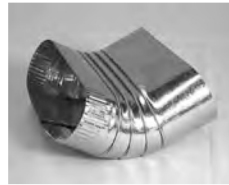
#607-OV 45° One Piece Vertical Oval Angle