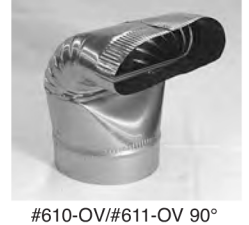
#610-OV/#611-OV 90° Round to Oval 90° Boot