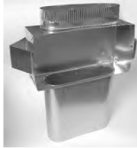
#622-OV Double Oval Stackhead