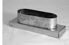
#625-OV Oval Adapter (not crimped)