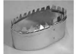
#640-OV Oval Starting Collar (not crimped)