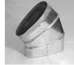
#608-OV 45° Flat Oval Angle