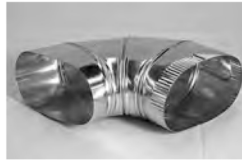
#606-OV 90° 4-Piece Flat Oval Elbow