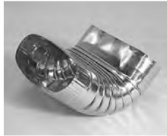
#605-OV 90° One Piece Vertical Oval Elbow