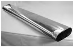
#600-OV (60") #601-OV (100")