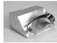
#635-OV Oval Box 45°