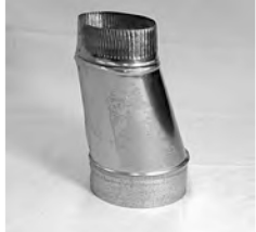
#613-OV Round to Oval Straight Boot