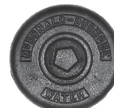
5623L Tapped 1 1/2"

* For available lid options, see page 12