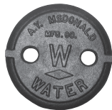
5601L Tapped 1" Erie Pattern