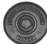
5614L* Tapped 1 1/4"