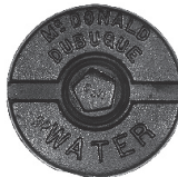
5607L* Tapped 1"