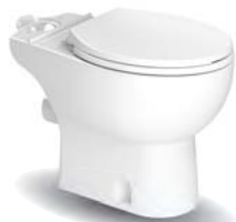
083/087 Toilet Bowl