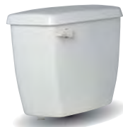
005 Toilet Tank