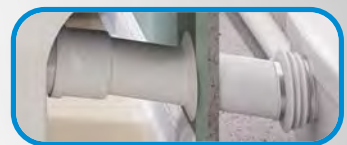
030 Extension Pipe

Choose any fixtures (sink, shower, bathtub) from different brands to complete your dream bathroom. There is no limit to what you can achieve with Saniflo systems. Increase your home value without major cost and have a full functioning bathroom in less than a day.