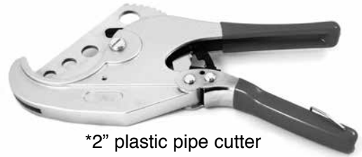
*2” plastic pipe cutter