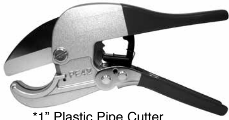
*1” Plastic Pipe Cutter