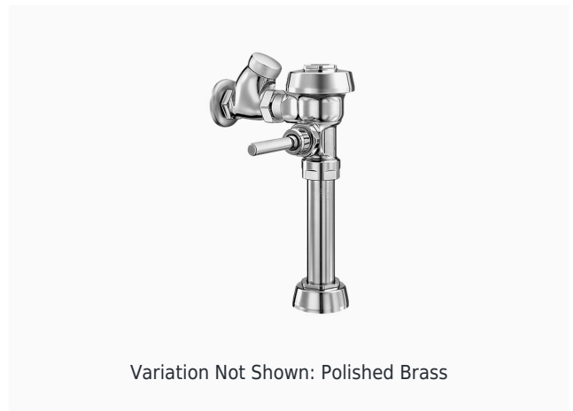
Variation Not Shown: Polished Brass