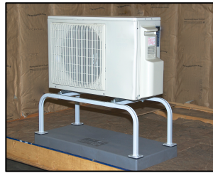
Photo #2 (On left) Mini-Split 12" Stand (side view) showing connection to stand.