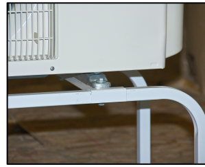
Photo #3 (On left) Mini-Split 12" Stand. Close-up of Spacer Bar w Saddle attachment.