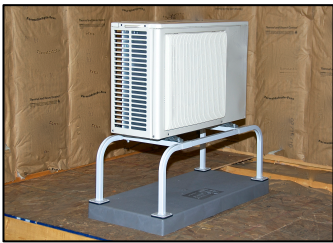
Photo #1 (On left) Mini-Split 12" Stand (Thin) with Unit shown on 18" wide pad.

Step #1: Remove U-Bar Frames (2 - Parts of MS107) from box and stand in place. Step #2: Remove Spacer Bar & Saddle (2 - Parts of MS108) and attach on top of U-Bar Frames to connect the two frames together. Step #3: Measure the distance between foot slots on your Mini-Split Condensing Unit and position Spacer Bars & Saddle the same distance apart. Step #4: Place Mini-Split Stand in place for installation. It is recommended to use a plastic, cement or other base to stabilize your overall installation (See Photo #1 or #2 for reference ).