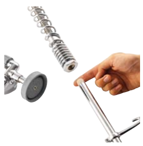
Step 2: Apply plumber's tape to top of riser threads and attach to spring assembly. Tighten with wrench.