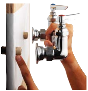
Step 1: Apply plumber's putty to backside of body and insert into mounting hole. Line up water supply lines and couplings, attach and tighten with

CHECKED: DMH 10-26-17 APPROVED: JHB 11-01-17