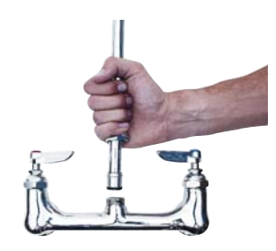
Step 4: Grab riser assembly and lower the EasyInstall® end-fitting into faucet body. Press down until the end-fitting "pops" in.