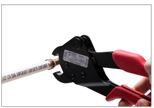
3. Position ring over sealing barbs of the fitting. The ring should be positioned approximately 1/8" to 1/4" from the end of the tube.