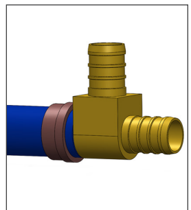
Crimp Tool did not engage the Crimp Ring over the entire surface of the ring.