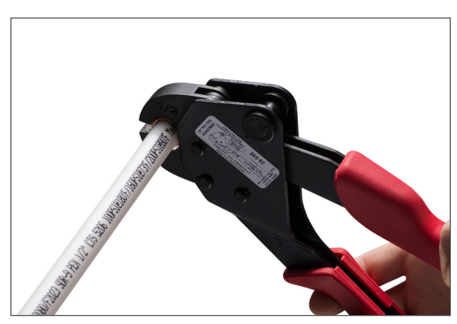
4. Compress tool perpendicular to tube. Compress only once. Remove defective connections. Use a gauge to assure a proper joint. Test all completed joints.