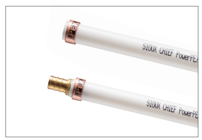
2. Install PEX Crimp Ring onto OD of tubing. Install PEX fitting fully into tube end.