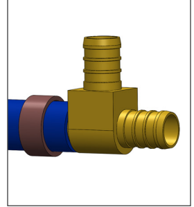
Ring placed too far forward or too far back & not positioned over sealing barbs of fitting.