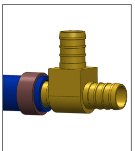
Fitting not inserted completely into tube end.