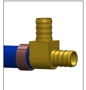
Improperly calibrated tool - not enough compression. Rings compressed multiple times may develop a leak path.