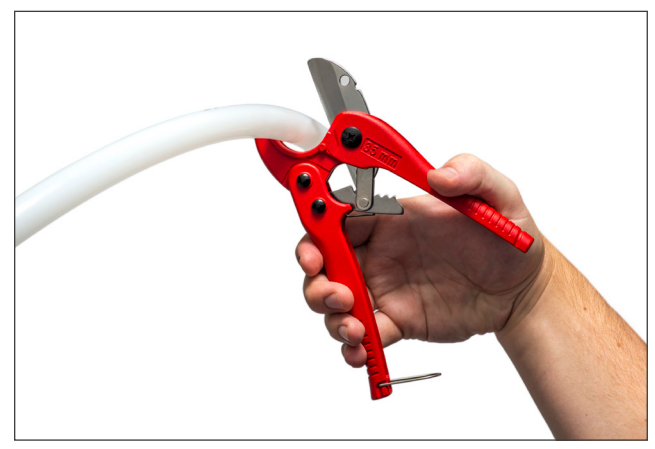
1. Cut tube at 90-degrees. Do not crush OD of tubing with cutters. Hint: Slightly rotate cutter during blade engagement.