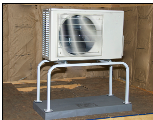
Photo #2 (On left) Mini-Split 18" Stand (side view) showing connection to stand.