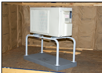
Photo #1 (On left) Mini-Split 18" Stand (Thin) with Unit shown on 18" wide pad.

Step #1: Remove U-Bar Frames (2 - Parts of MS110) from box and stand in place. Step #2: Remove Spacer Bar & Saddle (2 - Parts of MS108) and attach on top of U-Bar Frames to connect the 2 frames together. Step #3: Measure the distance between foot slots on your Mini-Split Condensing Unit and position Spacer Bars & Saddle the same distance apart. Step #4: Place Mini-Split Stand in place for installation. It is recommended to use a plastic, cement or other base to stabilize your overall installation (See Photo #1 and Photo #2 for reference).