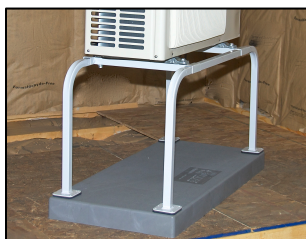
Photo #3 (On left) Mini-Split 18" Stand. View of Spacer Bar w Saddle attachment.