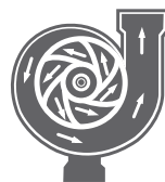
Up-Feed Pump Systems